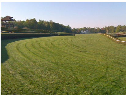
Looking down the finishing stretch