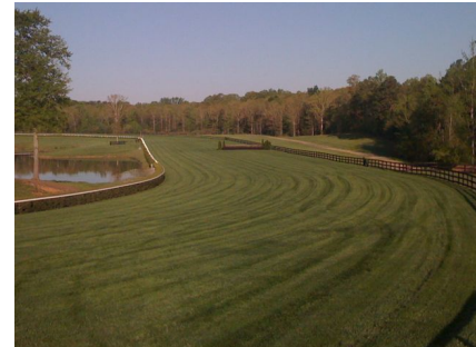
Club House Turn